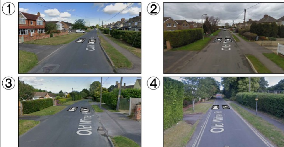
Speed Cushion Locations