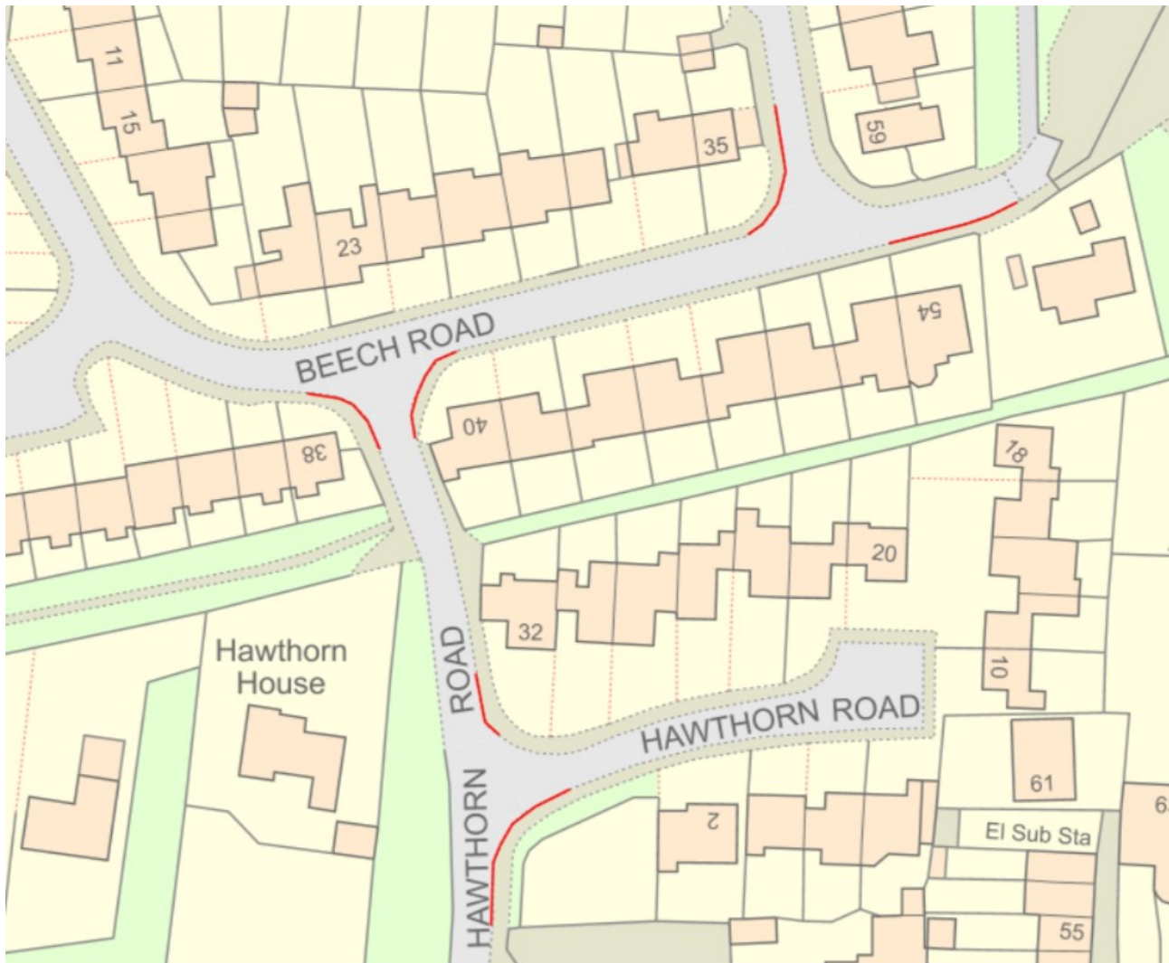
Map 2 - Beech Road/Hawthorn Road/Millmoor Crescent

Lining/signage requirements were discussed. It was proposed install 'no idling' signs at Hawthorn Road in the area of the school and to pursue the following new lines when the next TRO is pursued:-