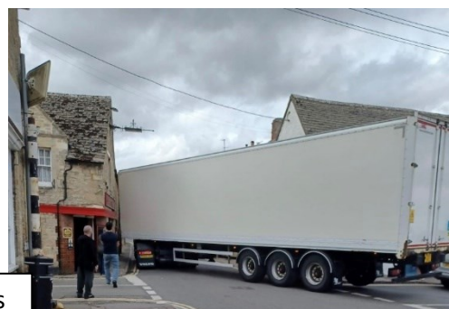
Photos of HGVs in difficult situations.