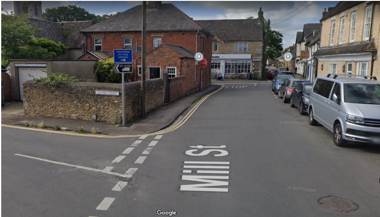
Mill Street/Acre End Street difficult junction for HGVs