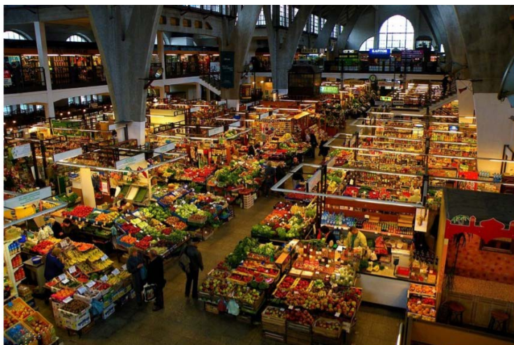
A local energy market buys & sells electricity instead of fruit and veg, but everyone still has to be able to get access to the market to get a 'good deal'.

The Smart and Fair Neighbourhoods programme will help us understand how to do this in an equitable and fair way for everyone in Oxfordshire so that we can all enjoy the opportunities and benefits it will bring.