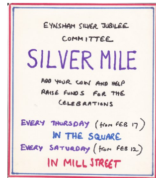
poster to promote the Silver Mile

The Silver Mile had two aims: to publicise the celebrations in June and to help raise funds for it. I doubt if the 5ps, 10ps, 20ps, the occasional 50p and odd 1ps and 2ps ever stretched more than 25 yards. But residents were remarkably generous as the final tally of £154.54 shows.