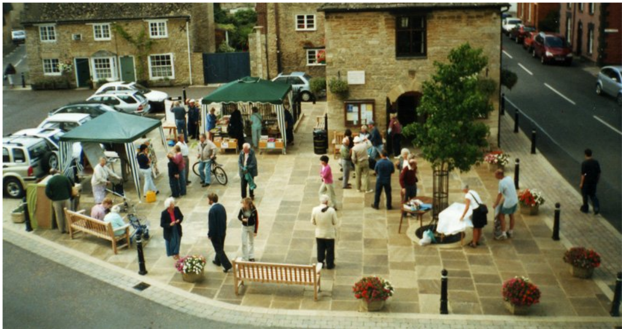
The renovated Market Square was officially opened on 7 September 2002